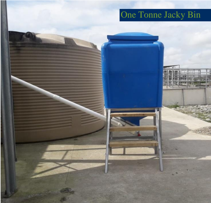
One Tonne Jacky Bin