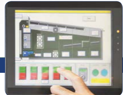
Optional PLC control panel with data recording